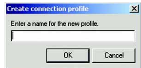
Figure 6-9: Enter Profile Name